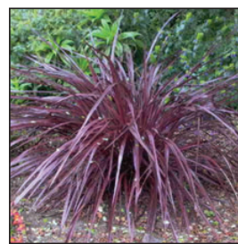
Cordyline 'Red fountain'