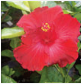
Hibiscus 'Molly cummings'