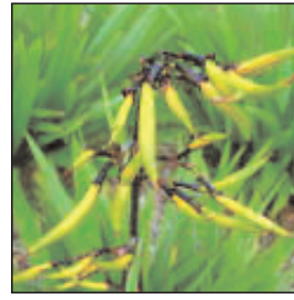
Phormium 'Emerald gem'