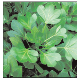
Psuedopanax 'Cyril watson'