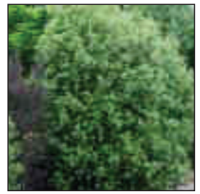
Pittosporum 'Mountain green'