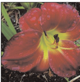
Hermerocallis 'Scarlet Orbit'