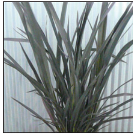
Phormium 'Black rage'